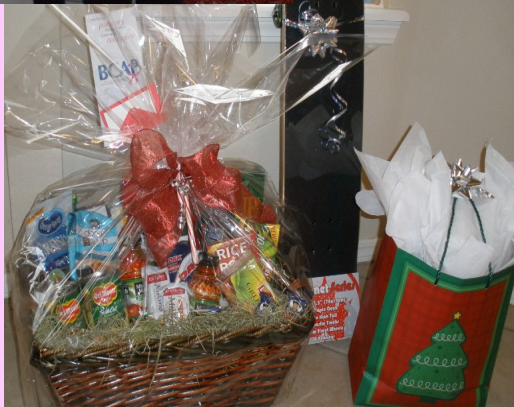
On the right, a basket, skate board and bag of gifts ready for delivery to a very special family.